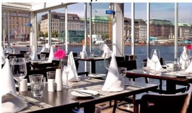
View from "Galatea"

We have tables reserved at a nearby restaurant.