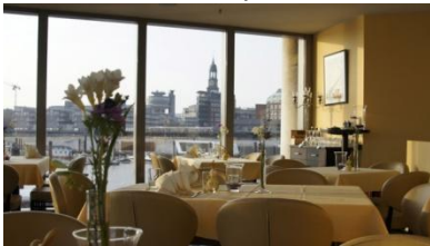
View from “Kehrwiederspitze”

Arrival at the “Kehrwiederspitze”-Restaurant from 6:30 pm. You will get a welcome drink and small snacks. Dinner will be a three course meal. It will be served from 8 pm. We have a reservation of the complete restaurant upstairs. The room offers a gorgeous view of the harbour, St. Michael’s cathedral and (hopefully) big ocean vessels. We may also use the terrace if the weather is fine. We negotiated a set price for the meals, all drinks (except strong spirits) are included. The nearest underground station is “Baumwall”. From there you can see the restaurant (and the new “Elbphilharmonie”). It is just 4 stops from the central station.